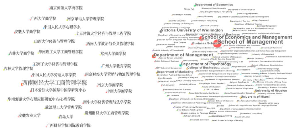
Figure 2. Distribution of leadership humor research institutions

low and the connection is poor. The network of cooperative institutions is mostly formed within universities or in the same region. Cross-regional cooperation is lacking, and the academic exchanges and cooperation between institutions need to be strengthened. In the distribution map of foreign institutions, there are 119 nodes and 142 connections, and the network density is 0.0202. The size of nodes in the distribution of research institutions varies greatly, indicating that the distribution of scientific research forces is unbalanced, and there are obvious marking points in the network.