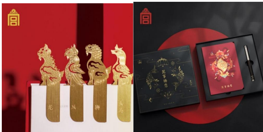
Figures 3 & 4. Notebooks and Bookmarks

The Palace Cultural Services Centre is responsible for developing creative products that are in line with the cultural heritage and key features of the Imperial Palace, for the promotion of cultural excellence in the society. Most of these products are well-made and highly operational, such as notebooks and bookmarks ( Creative Product , 2022, Figures 3&4). At the same time, there are many art derivatives that have been designed on the basis of the collections interior The Palace Museum. The products are designed in combination with collections, architecture and documentary history, and are rich in the culture and connotations of the Imperial Palace. For example, the paperweight ( Paperweight Definition , 2022, Figure 6) is based on the A Thousand Li of Rivers and Mountains (Wang Ximeng, 2022, Figure 5) in the collection of the Palace Museum. The paperweight here is a desktop object that is used to hold the paper when writing or drawing ( Paperweight Definition , 2022).