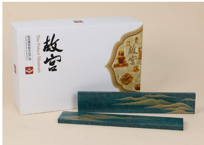
Figure 6. Paperweight

Note: A Thousand Li of Rivers and Mountains, From Wang Ximeng: One Thousand Li of Rivers and Mountains , by China Online Museum, 2022, (Museum. https://www.comuseum.com/painting/famous-chinese-paintings/wang-ximeng-one-thousand-li-of-rivers-and-mountains/ .)