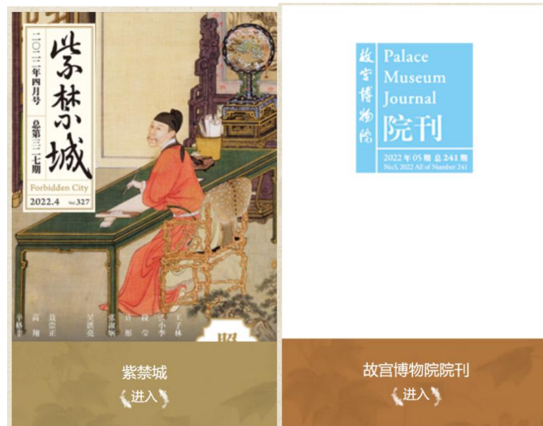
Figures 7 & 8. Palace Museum Journal and Forbidden City