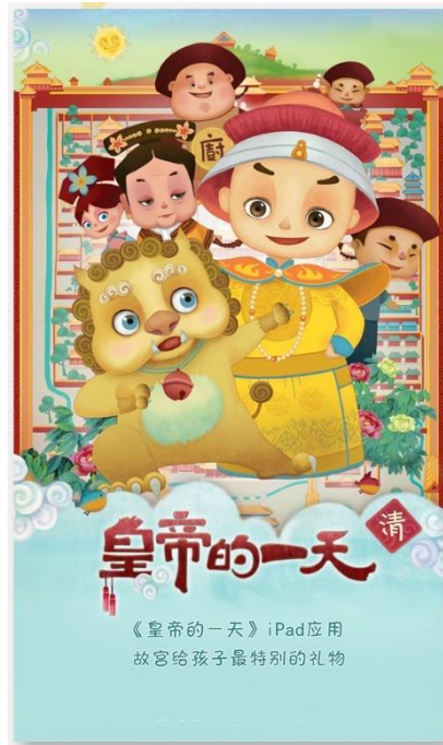
Figure 2. Emperor for a Day