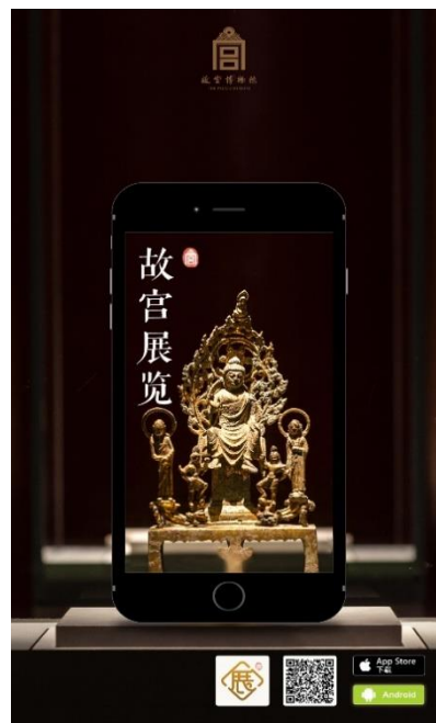
Figure 1. The Palace Museum Exhibition

At present, The Palace Museum has 38 institutions, while the development of art derivatives is carried out by the Material Information Department, the Palace Cultural Services Centre, the Palace Press and the Business Administration Division. The Material Information Department is responsible for developing the APP. A typical example is 'The Palace Museum Exhibitions' (Figure 1), an application that allows the public to view the Palace in its original condition, permanent galleries and special exhibitions, giving a general view of the most beautiful exhibitions of the Palace Museum ( The Palace Museum Exhibitions , 2017). Through in-depth experience of the wealth of traditional art and palace culture, it can also gain a deeper understanding of the depth and spirit of the Imperial Palace. In addition, there is also 'Emperor for a Day' (Figure 2), the museum's first application for children, and therefore has a lively and lively style, use cartoon characters to show Emperor's one day ( Emperor for a Day , 2015). The APP was originally conceived to spread traditional culture and give children a good overview of life in the Forbidden City and the history of ancient China, inspiring them as well. Digital communication enriches culture showing pleasure while adding depth and breadth to cultural communication.