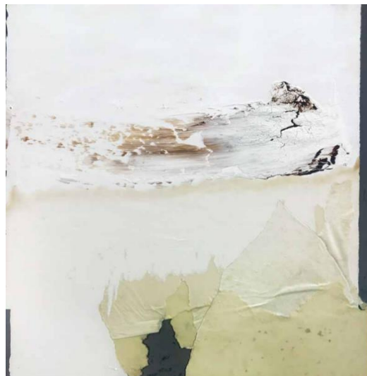
Figure 6. Chen Jinhua, The North Pole, 70 x 70 cm, 2020

Arctic by Chen Jinhua (Figure. 6) depicts the bitter cold of the white Arctic sky with sparse brushstrokes. The impact of the incomplete underpainting at top and bottom right emphasizes the condition of the work between finished and unfinished, separating the aesthetic topic from the “painting” and the “reality,” a perverted manifestation of the Western contemporary painting genre’s philosophy of “process over outcome.” The concept of “process above outcome,” popularized by the Western contemporary painting school, is distorted in this piece. The lacquer’s texture is extremely artistic and full of strong brushstrokes, evoking Titian’s style of painting. The mood he creates with his strong brushwork is not scary, but rather an admiration of the tremendous forces of nature standing in a sublime attitude. He depicts the intense cold of the Arctic, rather than the “bitter cold.” A spiritual core that dates back to 17th century Romantic painting, art is an externalization of human might; it reflects the courage and pride of man in overcoming and conquering nature. In contrast to Figure. 1(a), it is a study of its meaning rather than just a repeat of a Western school of painting. This sets it apart as a successful borrowing distinguished by fervor, thoughtfulness, and contagiousness.