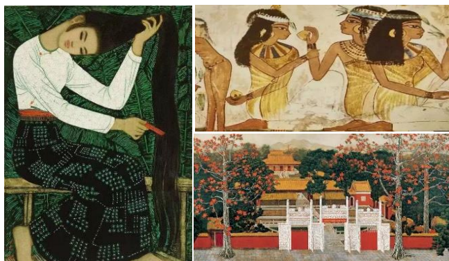
Figure 2. Left Qiao Shiguang, The Lady with Dressing , 45 x 60 cm, 1978, lacquer

The new period of art should place greater emphasis on taking inspiration from others and developing a distinctive and comprehensive linguistic expression system for lacquer painting. The emphasis is on the artist's capacity to leave the studio and engage with the world outside, getting close to people and the natural environment. Instead of placing themselves on a pedestal, artists should be inspired by the Western Romantic style of painting and concentrate on expressing their emotions, using lacquer painting as a tool to convey their core concepts.