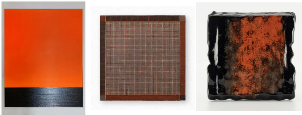
Figure 1. Works by contemporary lacquer artists (a.b.c)

The pieces shown above are by several modern lacquer artists, and while they all use pure methods, they all have the issues mentioned above to differing degrees. Western colorism is only repeated in Figure 1(a). Colorism disdains all styles of painting and concentrates solely on the expressive power of color. Frequently, the artwork consists only of a few distinct colors combined, or it may even be entirely one color. The influence of Western modern art is more of a violation of established painting conventions. Going for simple copying and repetition without considering the moments when the West has experienced worry and concern for the future of humanity since the Second World War makes little logic and neither creates a new visual impact nor affects the audience's emotions. Its lack of pictoriality and lack of emotional expression by the artist is the issue it portrays.