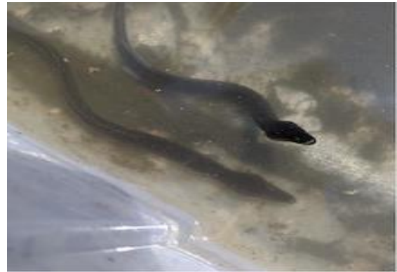
Figure 4. American Eels in the Gowanus Canal (8-7-20)