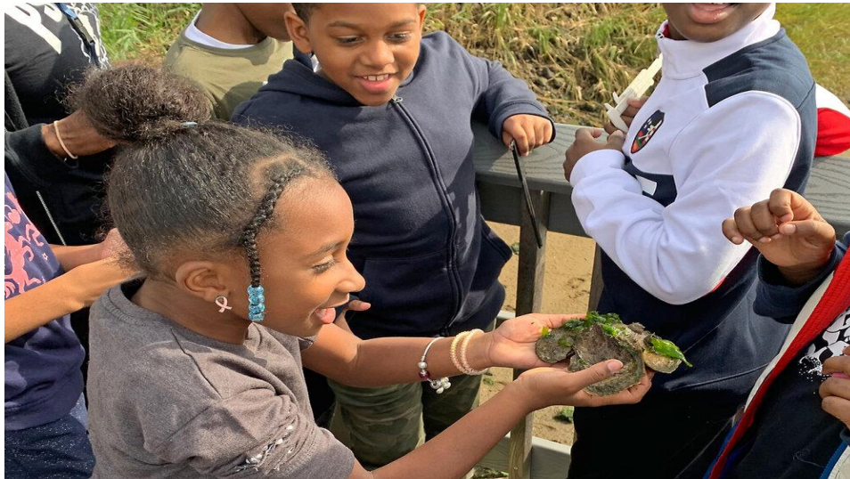
Figure 2. Oyster Research and Restoration in Canarsie, Brooklyn (2019)