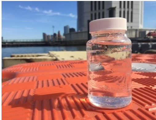
Figure 3. Water Sample from the mouth of the East River (6-26-20)