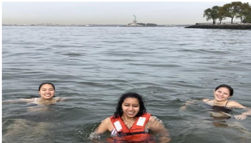
Figure 5. Citizen scientists in the waters of New York Harbor