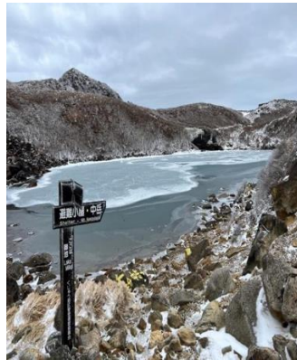
Figure 7. Lake Oike below Mt.Tengu-gajo