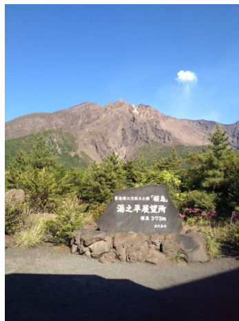
Figure 9. Sakurajima's Peaks viewed from Yunohira Observatory

The island's north and south sides have schools, hotels past their heyday, and onsen resorts. The Arimura Lava Observatory and promenade in the south is a unique location for viewing both the Taisho and Showa Lava fields. With views of the lava dome, block lava and the Shirasu Tableland, created from pyroclastic flows, it also has differing vegetation from the 30 year period between the eruptions (Sakurajima-Kinkowan Geopark, 2023).