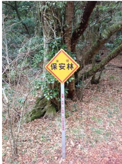
Figure 4. 「保安林」 (Ho-an-rin) Forest Protection