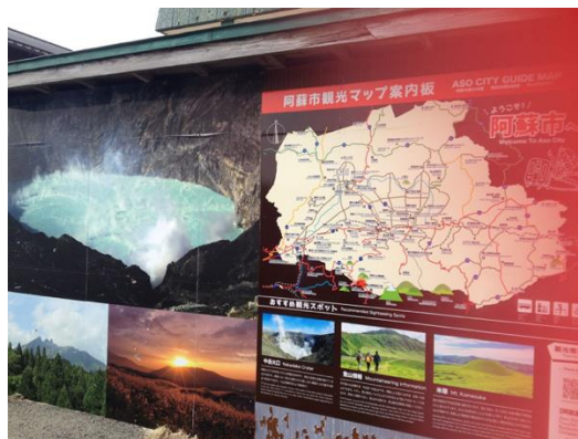
Figure 8. Mt. Naka crater (information board).