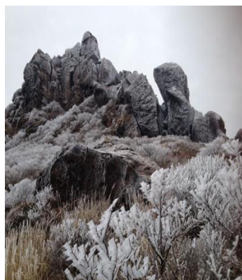
Figure 6. Mt.Hossho and hoarfrost on vegetation