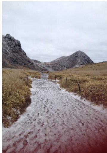
Figure 5. Nishi-senrigahama with Mt.Kuju (right background)

Makinoto Pass Trailhead is 5.3km from the Chojabaru Visitor Center. We visited it and walked the marsh's elevated, cedar boardwalk. It is wheelchair accessible, has both long and short courses and is designed to protect the rare ecosystem. (Chojabaru Visitor Center Website, 2023). A hot dip in the foot bath by the centre concluded the day. Visitors hoping to stay in the area have a limited choice of accommodation, and the immediate village area has seen better days, with few amenities.