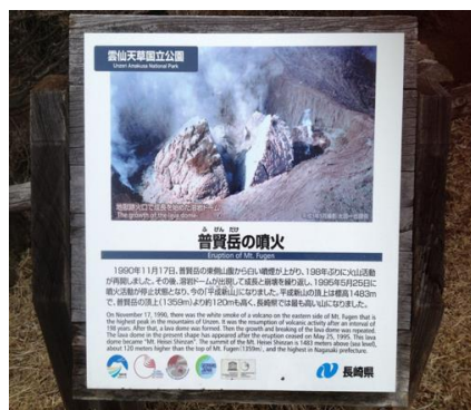
Figure 2. Mt. Fugen Eruption - Nagasaki Prefectural Office Information Board