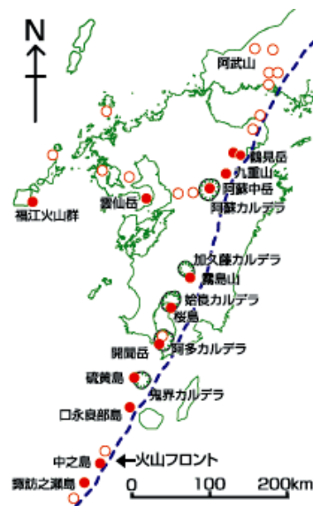
Figure 1. Aso Volcano's Location in Relation to Kyushu's Quaternary Volcanoes

While the neighbouring prefectures of Saga, Fukuoka and Miyazaki are also rich in natural beauty, and contain other popular geographical destinations, the geosites chosen for this study are situated directly on the Futagawa-Hinagu fault lines, which have contributed to complex lithology and unique geological landscapes (Aso UGGP, 2012).