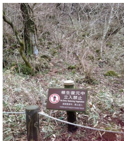
Figure 3. [No Entry. Restoring Vegetation]